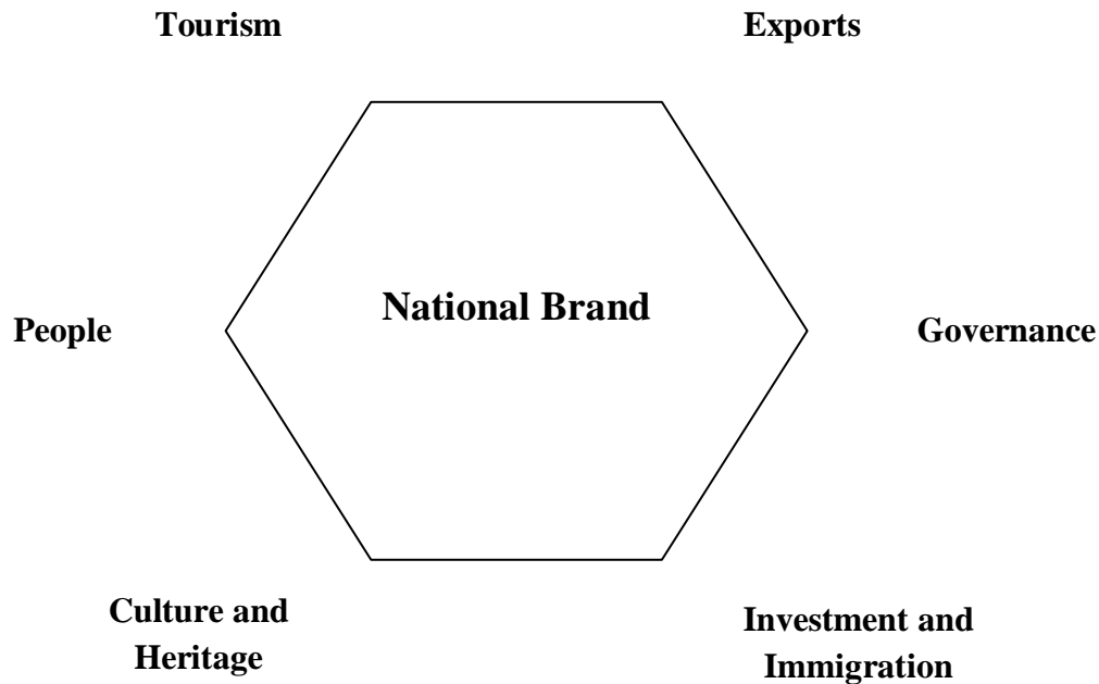
Figure1. The hexagon of competitive identity.